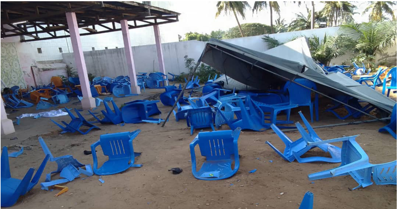
Photo of the ransacked site of the meeting during which the violent attack on an ECOWAS parliamentarian, Guy Marius SAGNA, and Togolese politicians and journalists took place.

On September 29, 2024, the violent attack on an ECOWAS parliamentarian, Guy Marius SAGNA, and Togolese politicians and journalists, by thugs during a political meeting organized by the opposition, testifies to the feeling of impunity of the supporters of the government who do not hesitate to attack foreign politicians. The participants were punched. The MP, who was taken to hospital, had clearly criticized the process that led to the adoption of the new Constitution in Togo. 25